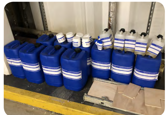
6. Using the Newton 324-SR resin, ASF Waterproofing were able to get the job done quickly and efficiently.