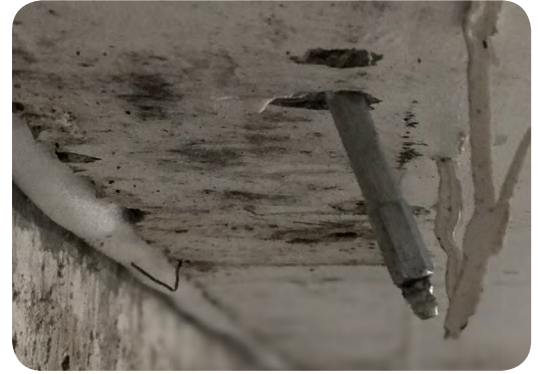
3. The movement joint is filled with a foam backing rod and the packer is inserted behind ready to inject

Newton recommends that our structural waterproofing systems are installed by one of our nationwide network of Newton Specialist Basement Contractors (NSBC) . Trained by Newton, NSBCs offer full professional indemnity on design, and insurance backed guarantees on the installation.