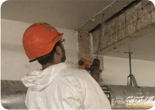
2. Drilling a hole for a 10mm injection packer above the movement joint that needed sealing