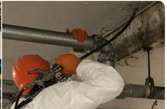
Sealing Movement Joints in a With Concrete Injection Resin