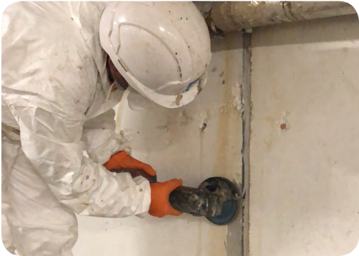
1. Grinding paintwork from concrete to create a good key for the Newton 106 FlexProof